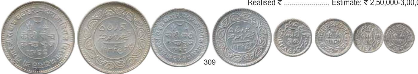
309 Rao Sri Khengarji III , Silver Set of 4, 5 Kori , VS 1988/AD 1932, 2 1/2 Kori , VS 1988/AD 1932, Kori , VS 1985/AD 1928, 1/2 Kori , VS 1985/AD 1928, with the name of George V, " KUTCH STATE BHUJ " on edge (RS# 233.56, 232.32, 231.1, 228.1). Extremely fine to about uncirculated. 4 coins.

Realised ₹ ..... Estimate: ₹ 2,50,000-3,00,000