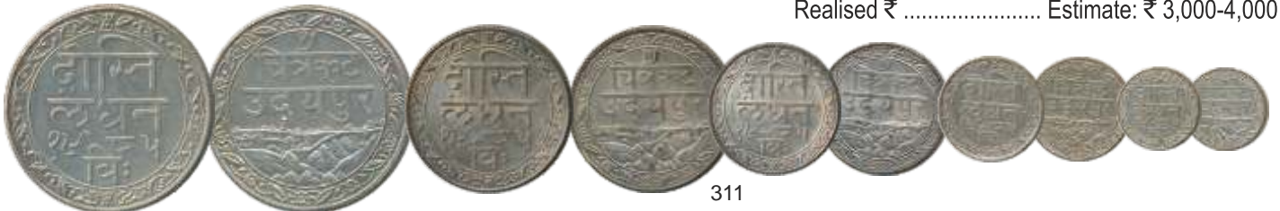
311 Fatteh Singh , Silver (5), Complete Set of Rupee , 1/2 Rupee , 1/4 Rupee , 1/8 Rupee and 1/16 Rupee , VS 1985, Udaipur Mint, Milled coinage series, Obv: Devnagari legend " Dosti Landhan " Rev: Devanagari " Chitrakoot Udaipur " (KM# Y# 22, 21, 20, 19, 18). Extremely fine to about uncirculated. 5 coins.

Realised ₹ ..... Estimate: ₹ 3,000-4,000