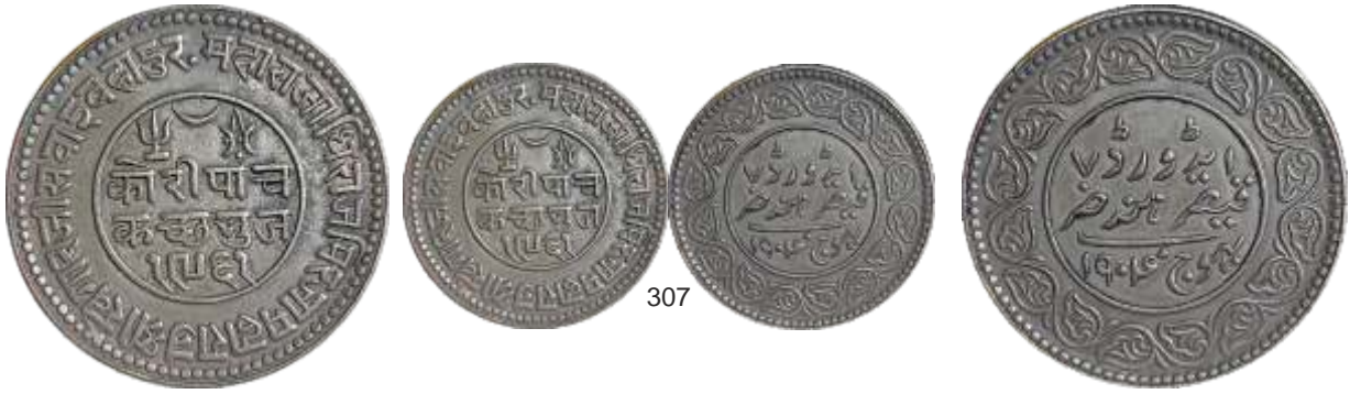
307 Rao Sri Khengarji III , Silver 5 Kori , VS 1961/AD 1904, with the name of Edward VII (RS# 219.5). Extremely fine, extremely rare. Kutch State coins in the name of Edward VII are exceedingly rare.

Realised ₹ ..... Estimate: ₹ 2,50,000-3,00,000