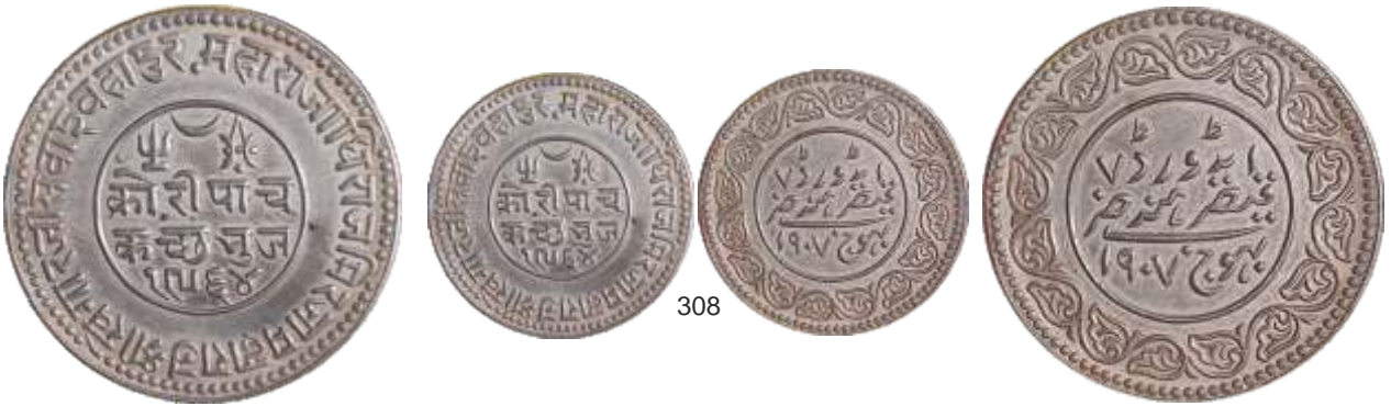
308 Rao Sri Khengarji III , Silver 5 Kori , VS 1964/AD 1907, with the name of Edward VII (RS# 219.11). About uncirculated, extremely rare. Kutch State coins in the name of Edward VII are exceedingly rare.

Realised ₹ ..... Estimate: ₹ 2,50,000-3,00,000