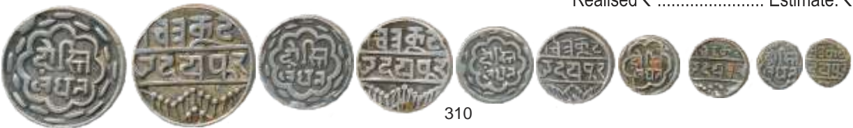
310 Silver Swarupshahi , Set of 5 coins, Rupee , 1/2 Rupee , 1/4 Rupee , 1/8 Rupee & 1/16 Rupee , Udaipur Mint, Dosti Londhon type (KM# Y# 11, 10, 9, 2, 7.1). Very fine+ to about extremely fine. 5 coins.

Realised ₹ ..... Estimate: ₹ 3,000-4,000