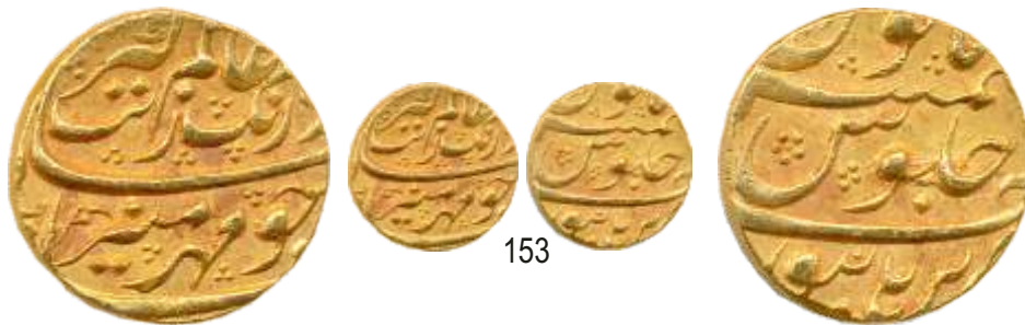
153 Aurangzeb, Gold Mohur , 10.97g, Burhanpur Mint (KM# 315.16). About extremely fine.

Realised ₹ ..... Estimate: ₹ 1,50,000-1,75,000