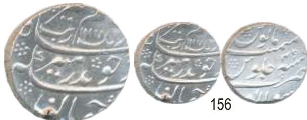
156 Aurangzeb, Silver Rupee , 11.48g, Solapur Mint, AH 1117/ RY 49 (KM# 300.82). About uncirculated.

Realised ₹ ..... Estimate: ₹ 2,00,000-2,50,000