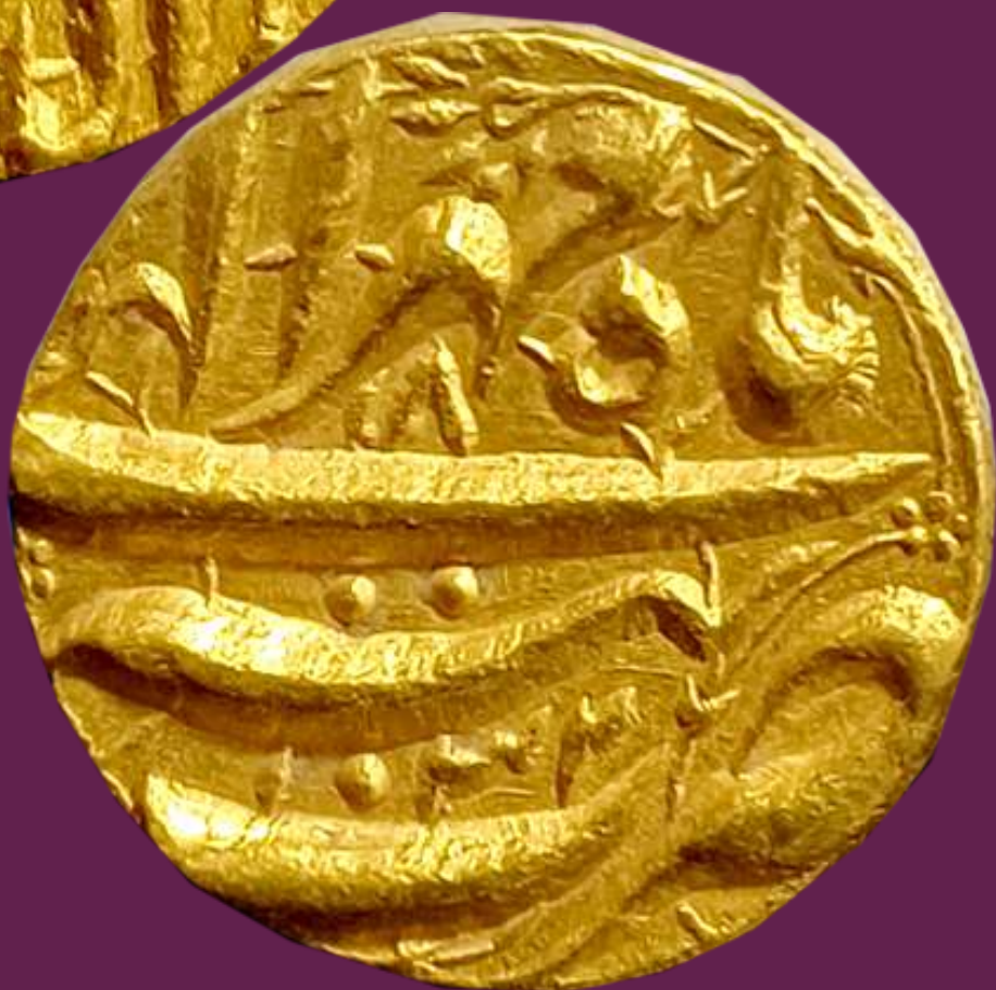
Mughals Jahangir, Gold Mohur, Tatta Mint