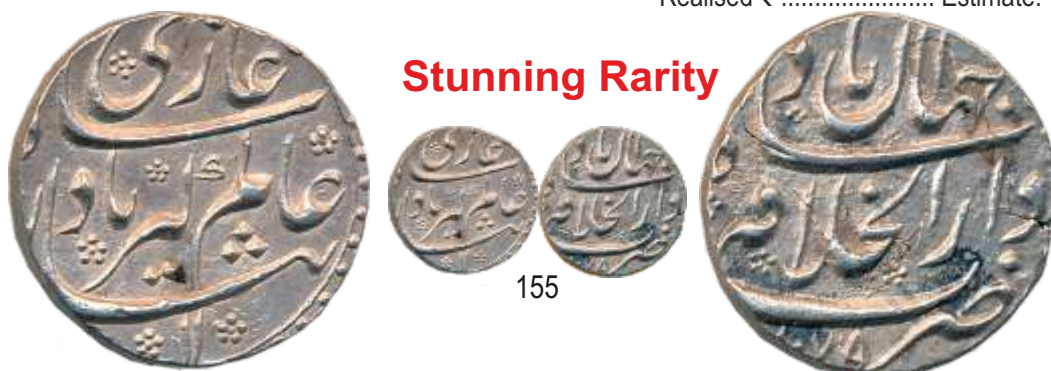
155 Aurangzeb, Silver 1/2 Rupee- Nisar , 5.68g, Dar al Khilafah Shahjahanabad Mint, AH 1079/ RY 11, Obv: Persian legend " Nisar Alamgir Badshah Ghazi " with RY at bottom, Rev: Mint name and AH date. Extremely fine, extremely rare.

Realised ₹ ..... Estimate: ₹ 40,000-50,000