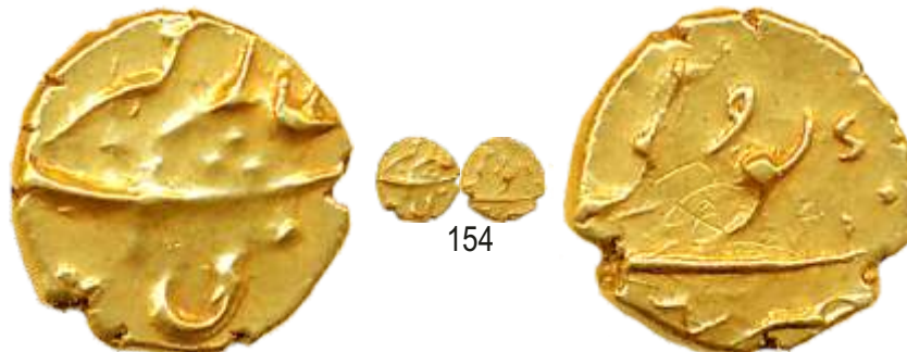
154 Aurangzeb, Gold 1/2 Hon , 1.70g, Guti Mint, RY (48), Obv: Persian legend " Alamgir Shahi ", Rev: Mint name and RY. Very fine, very rare.

Realised ₹ ..... Estimate: ₹ 1,50,000-1,75,000