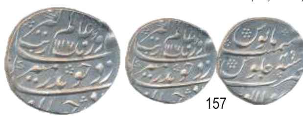
157 Aurangzeb, Silver Rupee , 11.49g, Solapur Mint, AH 1117/ RY 49 (KM# 300.82). About uncirculated.

Realised ₹ ..... Estimate: ₹ 2,000-2,500