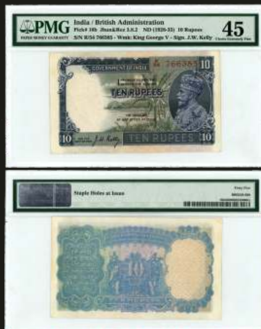
286 George V, Rupees 10, 3rd issue, Type 3.8, Signed by J W Kelly, Prefix R/54 (RIPM# 3.8.2). Slab & Graded by PMG as 45 Choice, extremely fine.