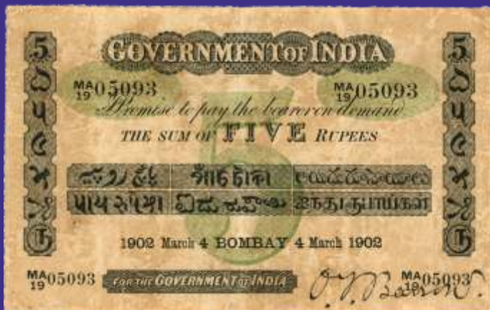
Edward VII, Rupees 5, Uniface