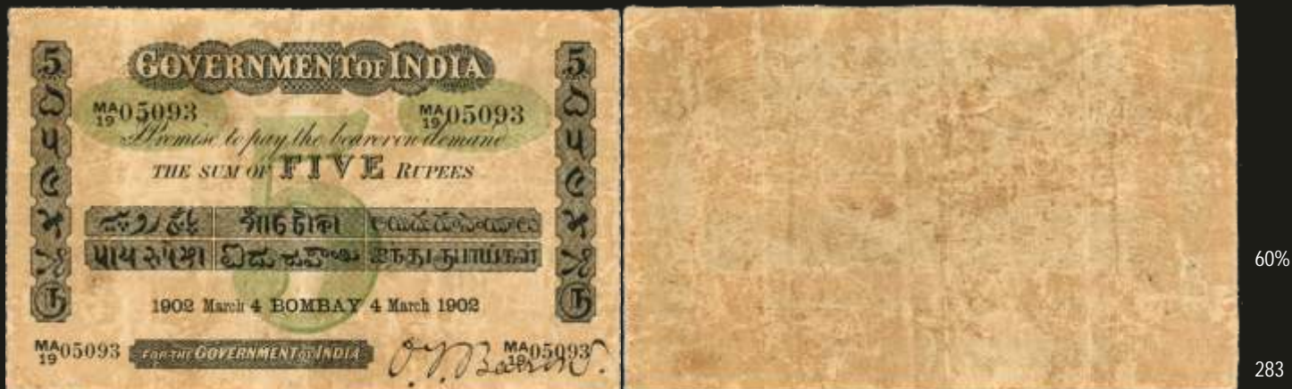
283 Edward VII, Rupees 5, Uniface, Green Under Print, Bombay Circle, Type 2A.1.2, Signed by O.T. Barrow, Dated 04 March 1902, Prefix MA/19 (RIPM# 2A.1.2.C.1). Very fine+, extremely rare.

Sold ` ..... Estimate: ` 80,000-1,00,000