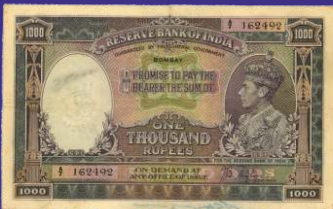
George VI, Rupees 1000, Bombay Circle