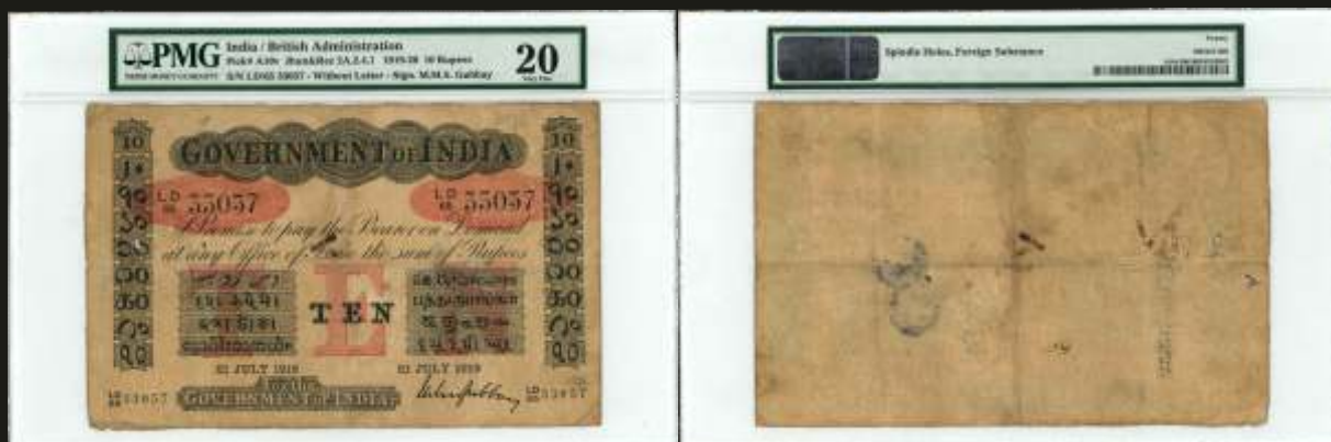
284 George V, Rupees 10, Uniface, Red under print, 4th issue, Type 2A.2.4, Universalised, Signed by M M S Gubbay, Dated 21 July 1919, Prefix LD/65 (RIPM # 2A.2.4.1). Slab & Graded by PMG as 20. Very fine.

Sold ` ..... Estimate: ` 80,000-1,00,000