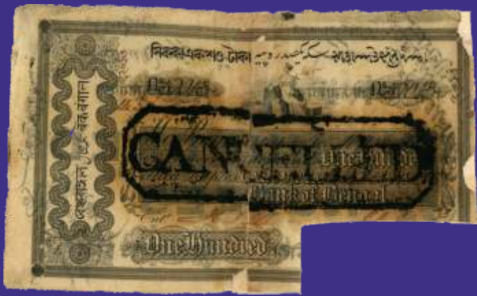
Bank of Bengal, 100 Sicca Rupees